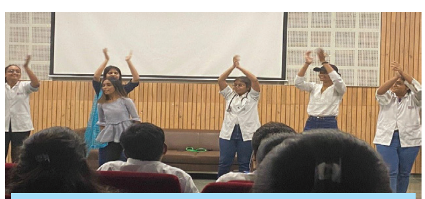
Physiotherapy Day Celebration